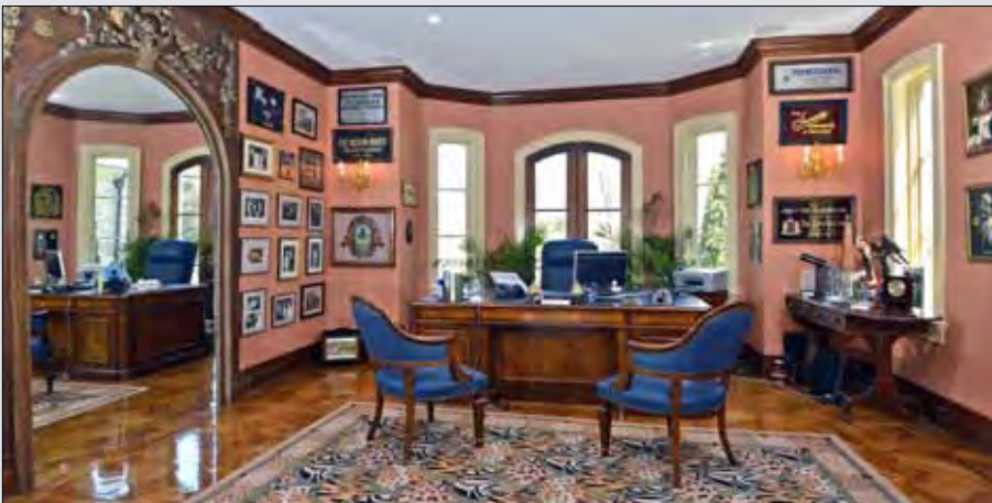
The Hearst Study/Office with wet bar, walnut parquet floors and ample built-in file drawers.