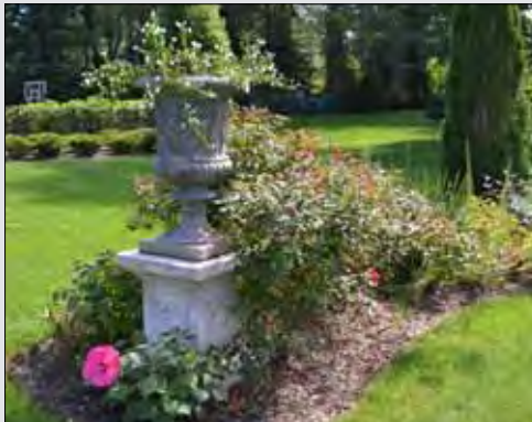
A pair of urns on plinth flank the romantic entrance to the pool gardens.