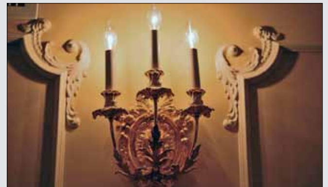
One of 14 gold Doré sconces illuminates the second floor gallery.