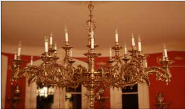
The tomato red dining room is set to a gracious glow by the 450-pound solid bronze, hand-cast Doré fixture.