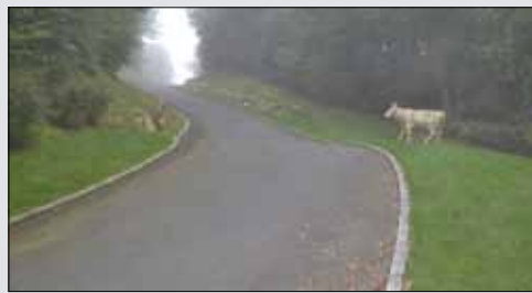
One of the original NYC "Cows on Parade" on the private road to her chateau.