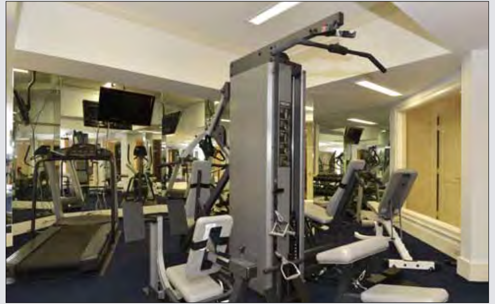
FINISHED LOWER LEVEL