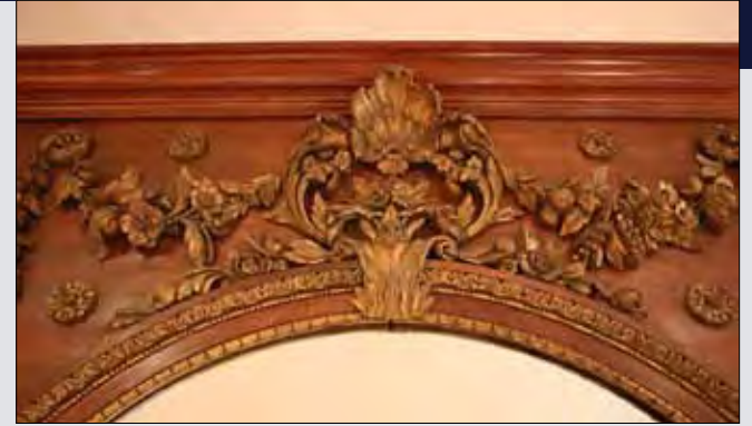
Fruit and flower gilt mahogany arch. Provenance: William Randolph Hearst's study, acquired from Giorgio Armani.