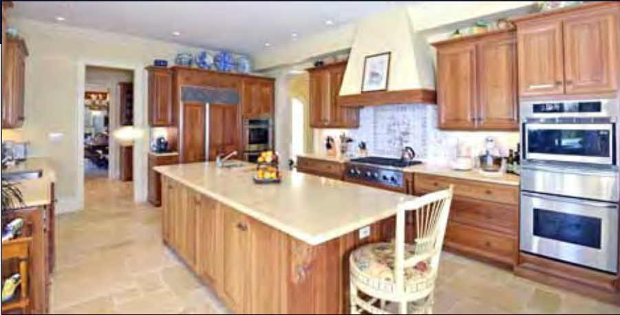
Two Sinks, 3 ovens, warming drawer, 10 ft. island with additional refrigerator drawers are just the start.