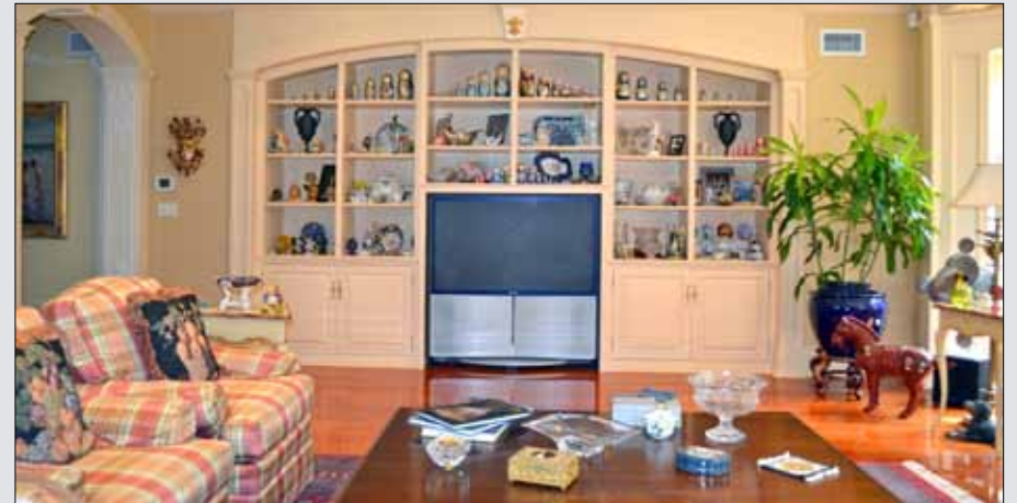
Truly a family room. A cozy place to settle right by the kitchen