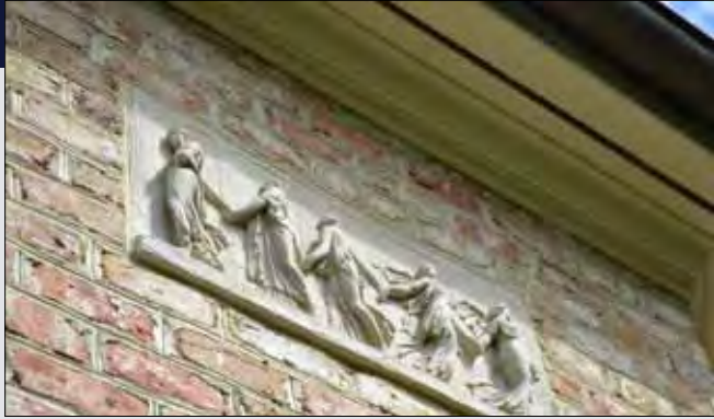
Friezes of the Five Muses dance on all sides of the turreted breakfast room.