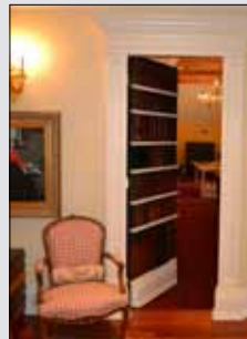
Second floor sitting room with balcony. A 39-ft. studio is concealed behind the "antique bookcase."