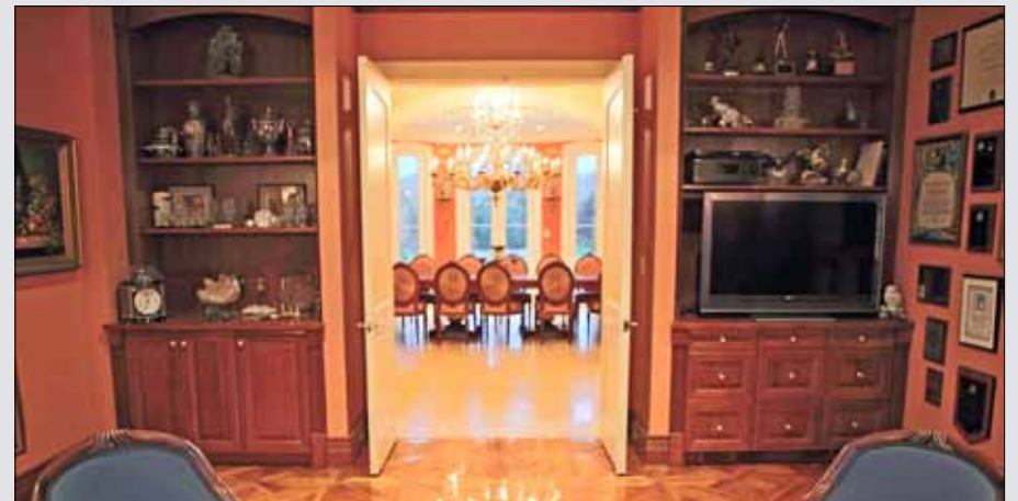
Sumptuous view from study/office.