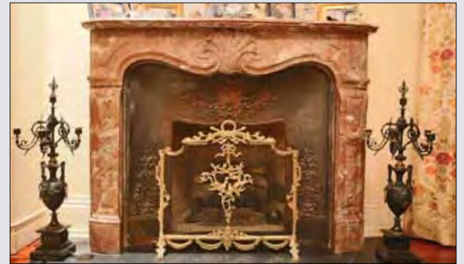
One of two Parisian mantels with original cast iron bib. Circa: Early 1800's