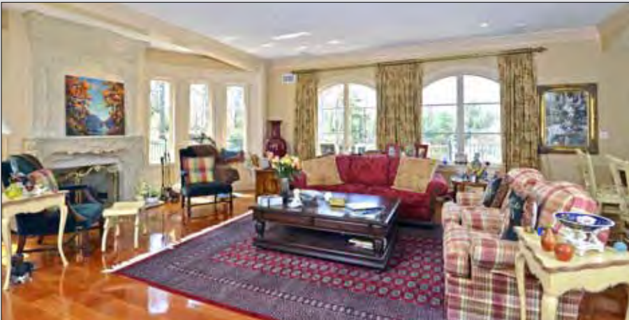
The French Rococo fireplace reflects its glow on the broad plank pegged Rosewood floor.