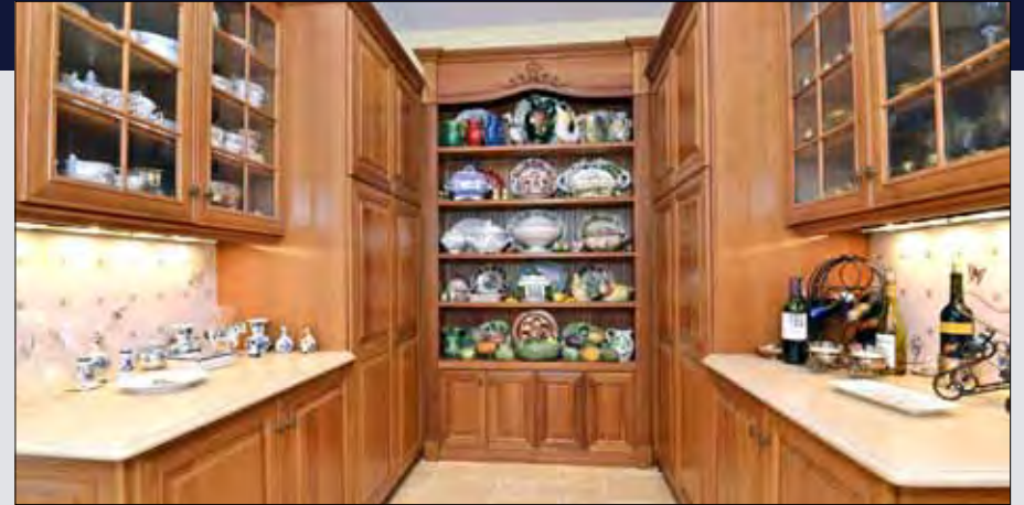
Vaulted butler's pantry with sink and quiet dishwasher